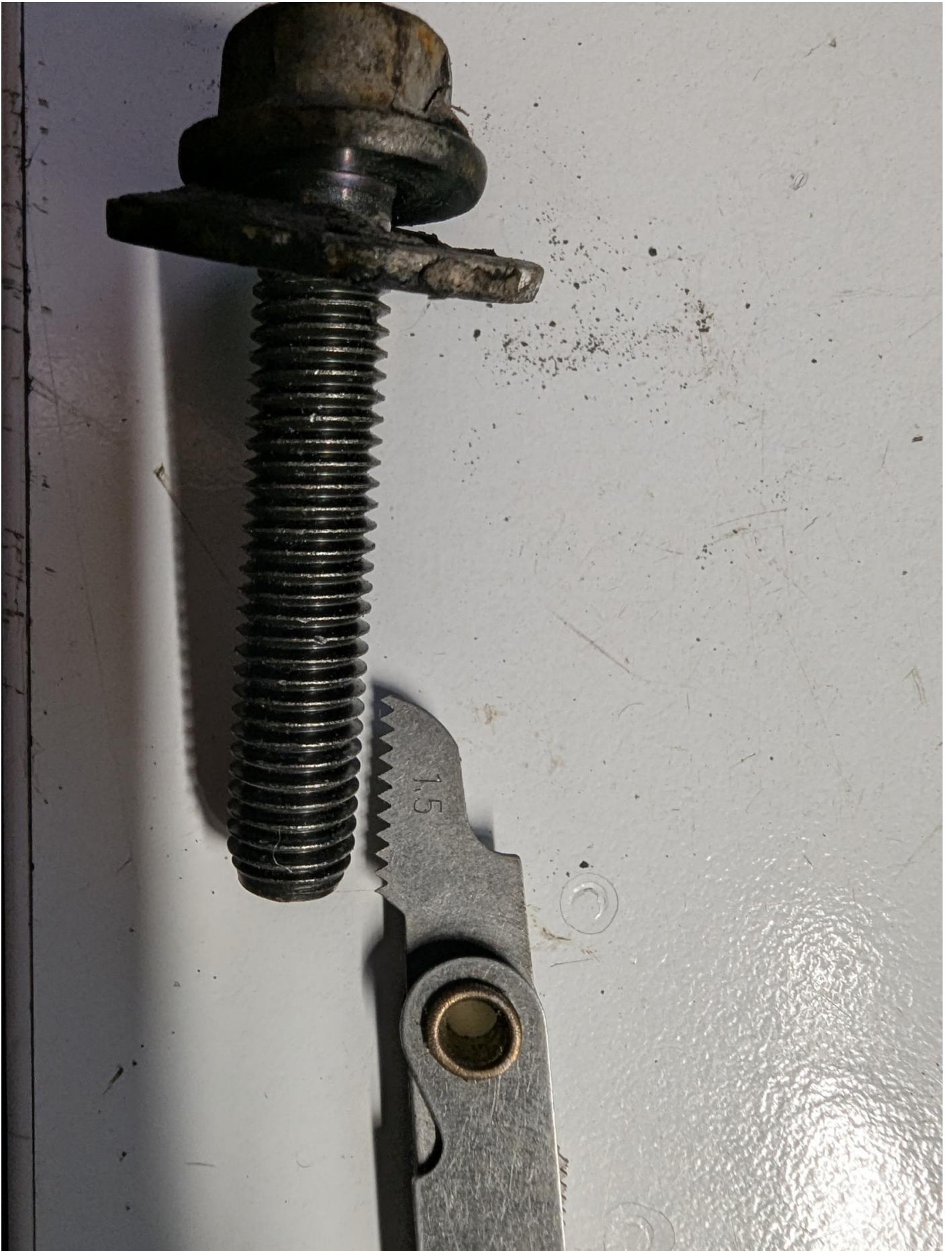
Front plate to chassis small Bolt